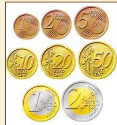
The currency in Belgium, the Netherlands and Italy is the Euro (€).

Please be aware that you can only receive your first payment after opening a bank account, which takes a couple of days. Please foresee some cash for the first days in Leuven.